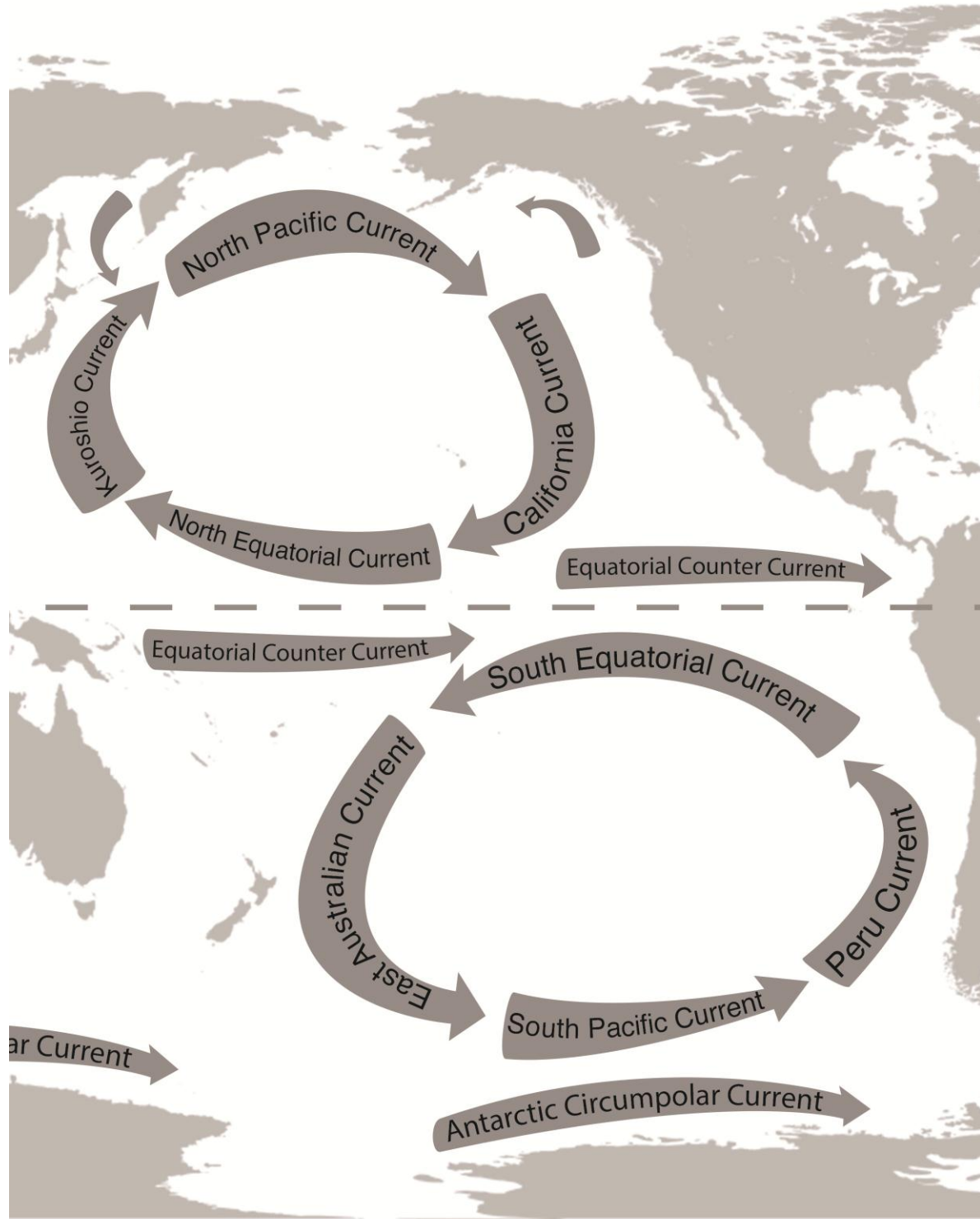
Graphic: Pacific Ocean Surface Currents Map